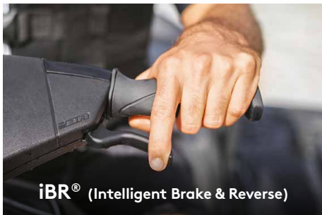
iBR® (Intelligent Brake & Reverse)

Exclusive to Sea-Doo®, iBR® stops the watercraft sooner and provides more control and maneuverability at low speeds and in reverse.