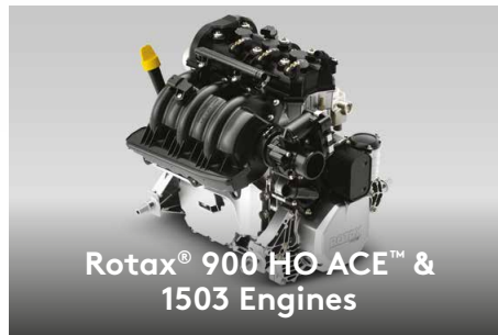
Rotax® 900 HO ACE™ & 1503 Engines

Exclusive to Sea-Doo®, iBR® stops the watercraft sooner and provides more control and maneuverability at low speeds and in reverse.