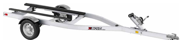
Aluminum MOVE I Extended 1250