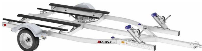
Aluminum MOVE II